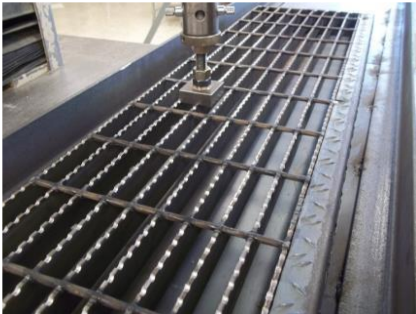
Photo No. 8 Part 2 - IBC Loading -533lb Load at Position 3