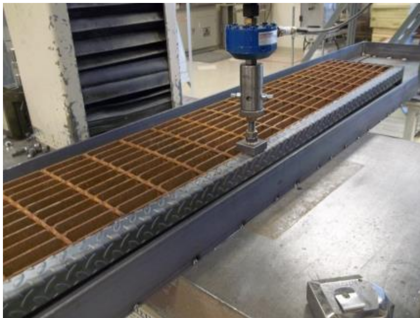
Photo No. 6 Part 2 - IBC Loading - 533lb Load at Position 1