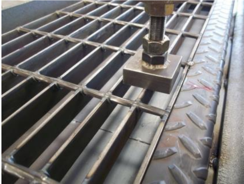
Photo No. 7 Part 2 - IBC Loading -533lb Load at Position 2