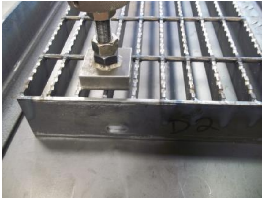
Photo No. 9 Part 2 - IBC Loading -533lb Load at Position 4