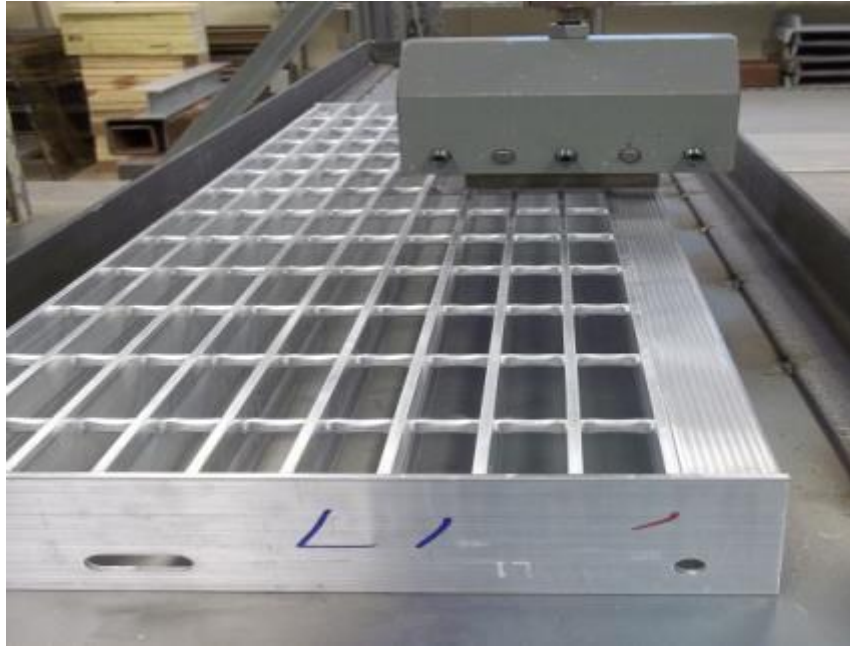
Photo No. 3 MBG 531 Loading - Part One - 300lb Load at Mid-Span