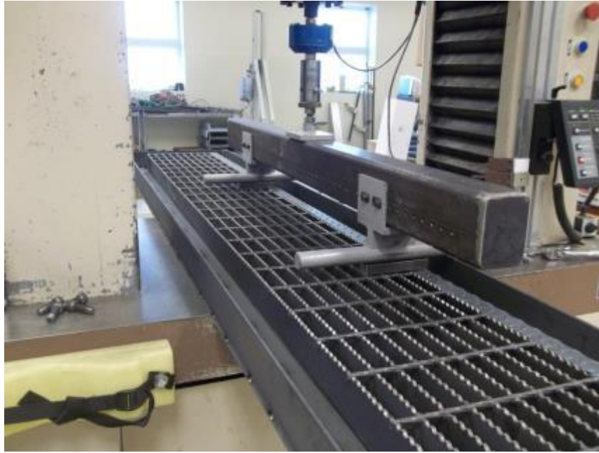
Photo No. 5 Part 1 -MBG Loading - 300lb Load at each 3 rd Point (Treads span over 5'6")